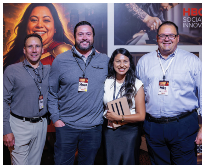
HOPE BUILDERS' SUPPORTERS launch careers that create lasting impact for individuals and future generations.

We are especially grateful for our Bronze-level supporters and above — those giving $5,000 or more — whose generosity fuels our programs, expands opportunities, and makes a lasting impact in the community.